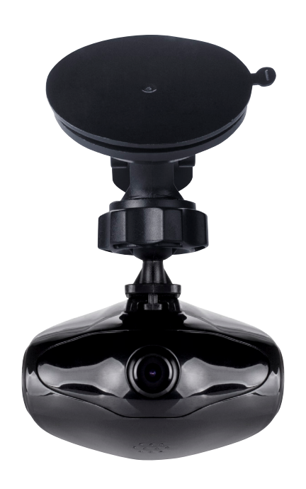
DASH CAM INSTRUCTIONS